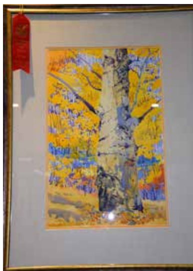
"Emperor of Aspen Grove" CSAG 2016 Regional Art Show "Autumn Spirit"